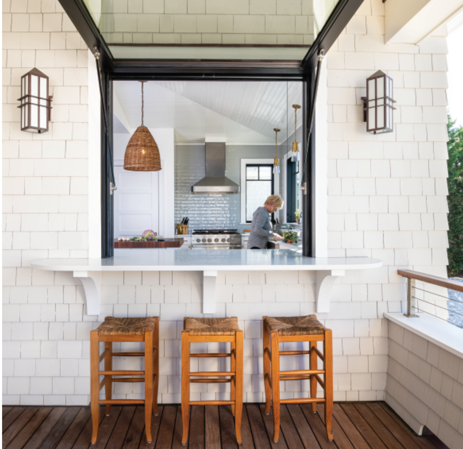
Homeowner Rae Celentano is pictured preparing a meal through the hydraulic pass-thru window. “It’s completely manual,” Bubnowski says, but it’s “very functional and gets lots of use.” Extending the interior quartzite countertop outdoors, he adds, “creates the appearance of one large, seamless slab of stone.”

The kitchen and dining area were treated as one continuous open space, making the 320-square-foot kitchen appear much larger than it is, Bubnowski says. Among the priorities were a large island to accommodate the entire family and lots of windows that face west where the owners would eventually add a pool. “Whenever we design kitchens with lots of windows, it’s always challenging to find alternate areas for storage,” Bubnowski says. Here he tucked multiple storage amenities into the base of the approximate 10-foot-long, 4-foot-wide island.