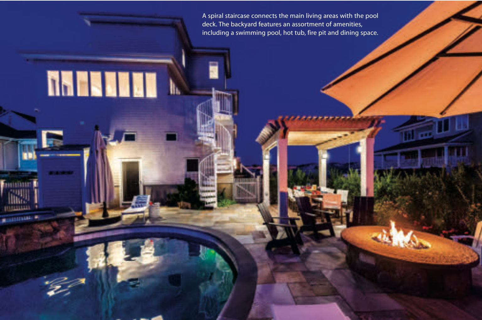
A spiral staircase connects the main living areas with the pool deck. The backyard features an assortment of amenities, including a swimming pool, hot tub, fire pit and dining space.