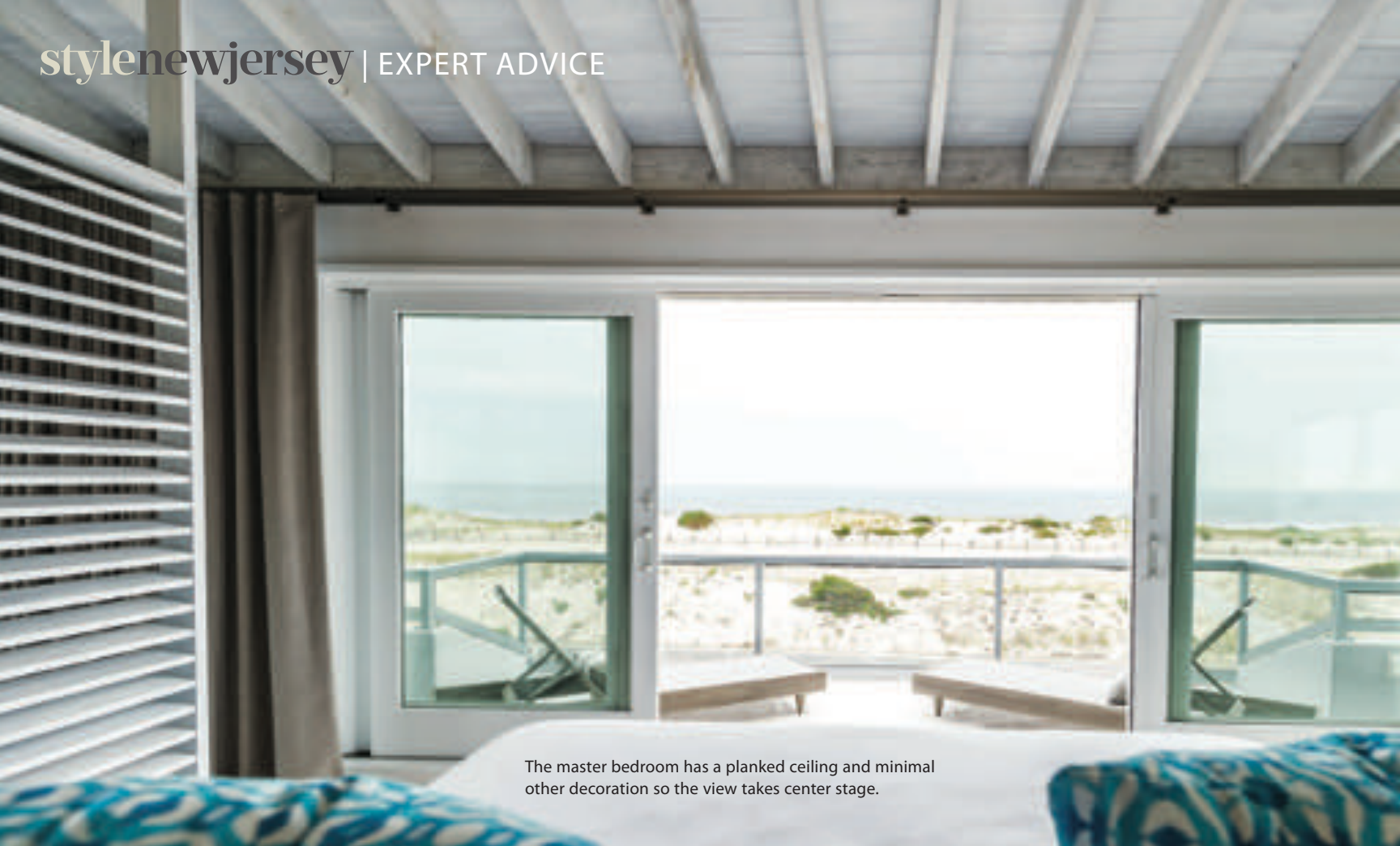
The master bedroom has a planked ceiling and minimal other decoration so the view takes center stage.

DNJ: What issues did you have to consider because this home is in a beach community?