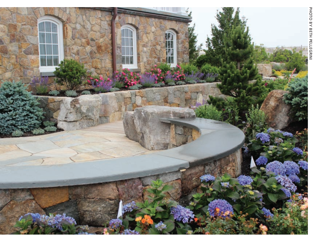
Most of the planter walls were built at seat height for those who want to sit and enjoy the surroundings. Pellegrini included flowers in a variety of colors in her landscape design.

The landscaping at the front of the house required even more highly resilient plants because the ocean is just steps away. Pellegrini included such sturdy specimens as rugosa roses, blackeyed Susans, and 'Torulosa' junipers. At both the front and back, Pellegrini "tried to get as much in the palette as possible. We used a lot of shrub roses, hydrangeas and daylilies. There's a lot of summer color."