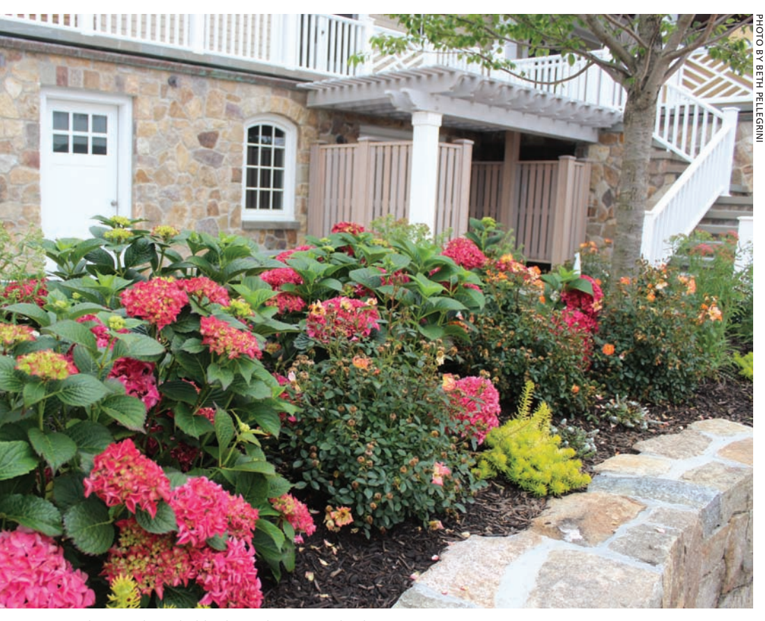
Hydrangeas bring bold color to the summer landscape.