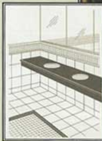
THE BRICK HOUSE, WYCKOFF, NJ

Complimentary In-Home Consultation and Drawings for your project!